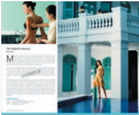
Double Page spread